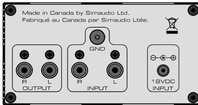
Figure 6: MOON 110LP Rear panel

The rear panel will look similar to Figure 6 (above). There is one pair of single-ended inputs on RCA connectors located in the center with a ground post directly above. Connect the cables from your turntable to these inputs and the ground lead wire to the ground post. There is one pair of single-ended outputs on RCA connectors located to the left of the inputs. Using a pair of RCA terminated interconnect cables, connect these to your preamplifier/integrated amplifier. Don't hesitate to use high quality interconnects. Poor quality cables can degrade the overall sonic performance of your system. Finally, on the right side is the power supply input connector, labeled "18VDC INPUT" for use with the included power supply.