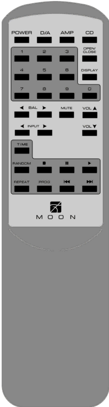
Figure 3: CRM-2 Remote Control

The MOON i.5 Integrated Amplifier uses the ' CRM-2 ' full-function remote control (figure 3). It operates on the Philips RC-5 communication protocol and is can be used with other Simaudio MOON components.