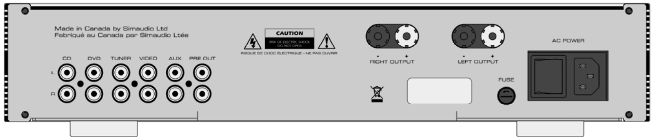
Figure 2: MOON i.5 Rear panel

The rear panel will look similar to Figure 2 (above). There are five (5) pairs of single-ended inputs on RCA connectors labeled CD, DVD, TUNER, VIDEO and AUX. The left channel inputs are located on top and the corresponding right channel inputs are located directly below.